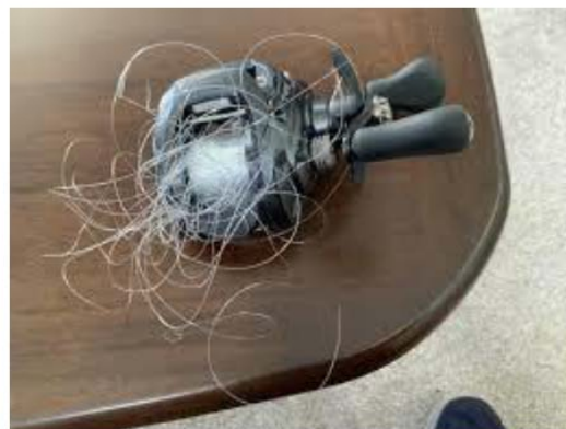
The other type of Birds Nest

Too much free spool will end in overruns or backlash, and the inevitable the dreaded 'Birds Nest' Keep your spool tension tighter in the cast mode until you become familiar with its operation, then gradually back it off as you get more confident. Don't try for distance as much as control of the functions of the reel and a smooth rod action in the casting motion.