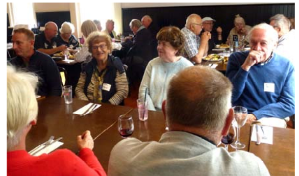
The “Legends” enjoying lunch and a chat